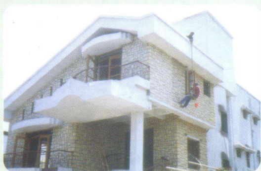
A Typical ALGICOAT TM ACRYLIC house